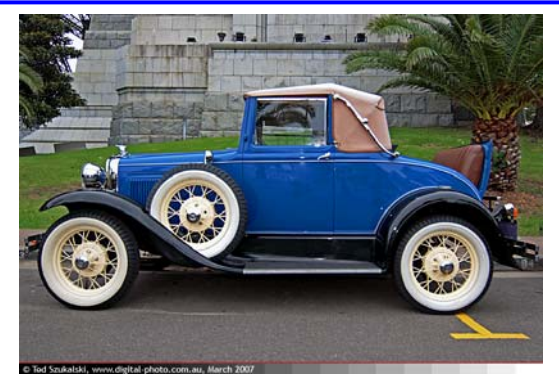
The 1929 – 1931 Model A Ford Convertible Cabriolets (Types 68A, B & C) were premium Model A body styles. Cabriolets had two doors, a passenger compartment with a bench seat which could accommodate two adults comfortably and a standard rumble seat which could accommodate two additional passengers in fair weather. Mal's Blue Cabriolet above.

Until late 1931 when the A400 Convertible Sedan was introduced, the Cabriolet was unique to the Model A line, in that it had a folding top and glass side windows, offering protection from elements comparable to a closed car and the advantages of an open car in fair weather. The crank operated side windows could be rolled up or down to provide weather protection with the top closed or to serve as wind wings with the top open.