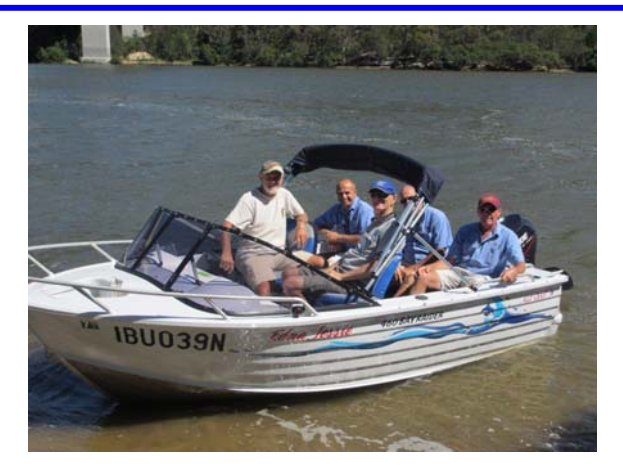
After coffee and cake we spent our day walking, chatting, some energetic members climbed up to the bridge for a birds eye view, while the "Edna Jessie" conducted a few tours of the river.