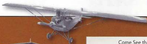
Come See the Model A Powered Pietenpol Aircraft Now On Display!

In 1935, Time Magazine reported that it was not uncommon for a Good Humor Ice Cream salesman to earn as much as $100 a week. That was an amazing sum when one considers the Great Depression. In order to sell the product, a dozen Ford trucks were purchased, all equipped with the customary bells to attract attention. The 1931 ice cream truck is now one of the many vehicles on display in the Model A Ford Museum.