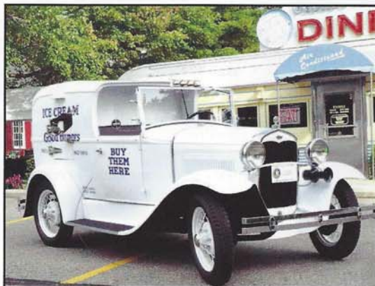
1931 Town Car Delivery

At this year's celebration, a swap meet was added to the event, as was the introduction of the Model A Ford Hall of Fame. The obvious choices for the inaugural induction into the hall of fame were Henry and Edsel Ford. With Henry's management skills and Edsel's flair for design, the "new Ford" was destined for success.