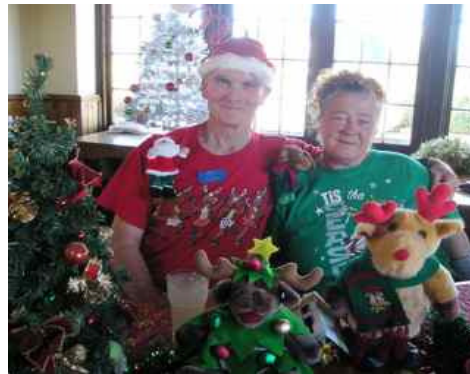
The Dalton's spectacular showing.