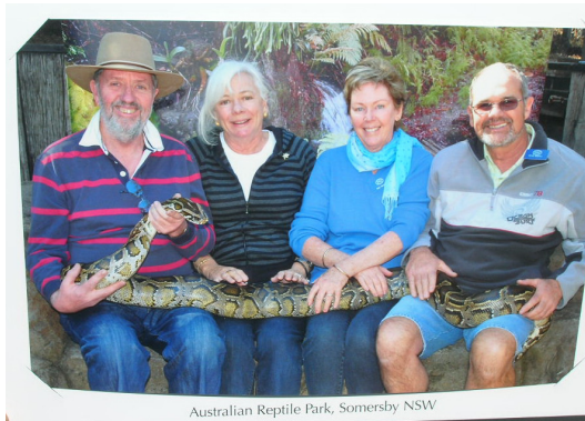
Australian Reptile Park, Somersby NSW