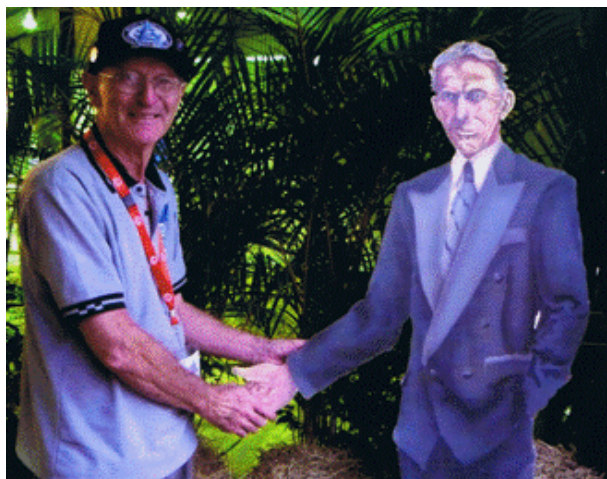
"Our President meets God"