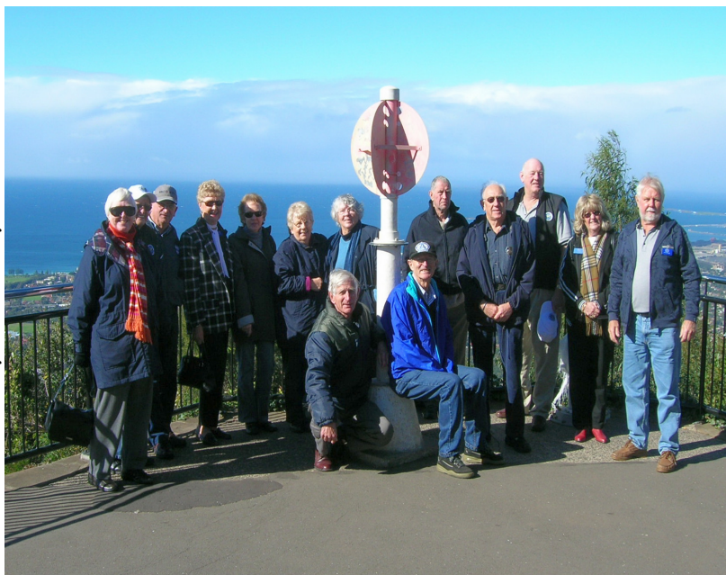
Some of the group at Mt Leira lookout.