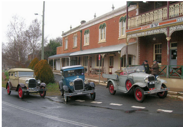
At the Rockley Hotel