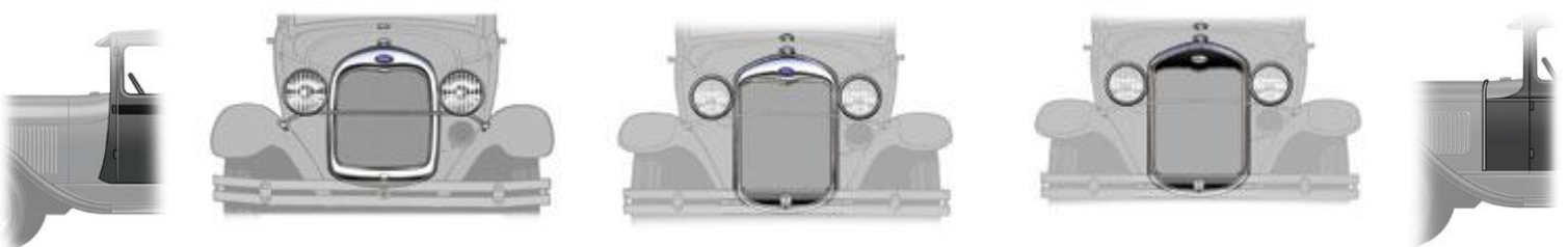
28/29 Front View