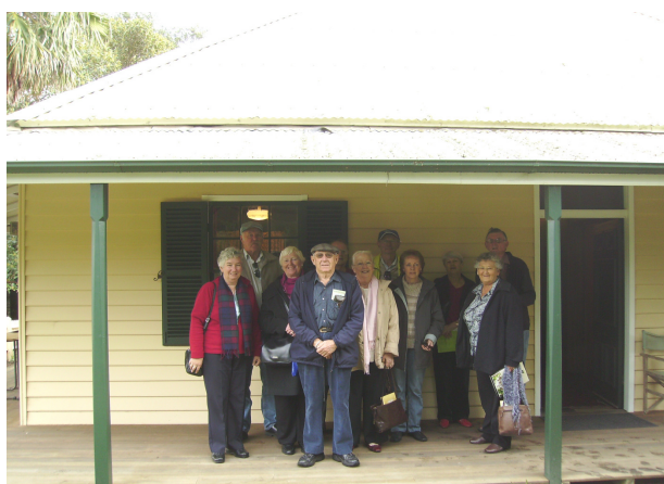
At Roughley House