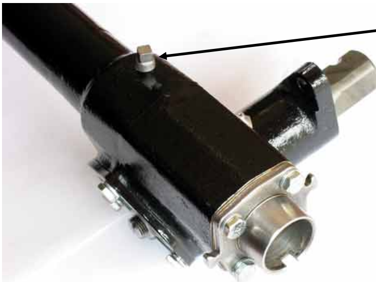
1930 - 1931 2 Tooth with oil plug. 600w gear oil only.