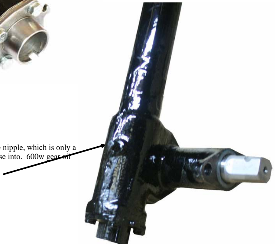
1928 - 1929 7 Tooth with grease nipple, which is only a plug, not to be used to load grease into. 600w gear oil only.