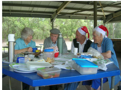
The Browns and the Bates 15/11/08