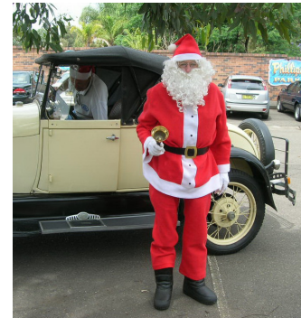
Santa Norm 15/11/08