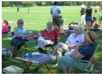
Memorial day 19/10/08