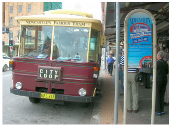
Newcastle tram - Wanderers 5/11/08