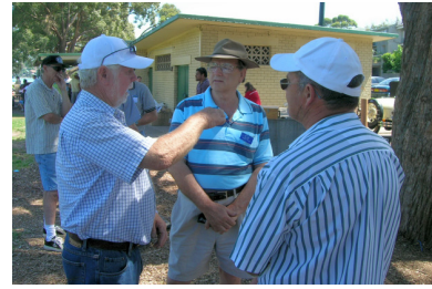
Memorial Day 19/10/08