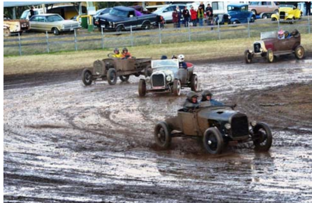
Lot's of Model A Competition..