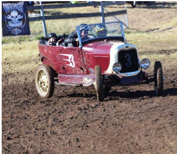
The Hale Mob in a DRIFT....