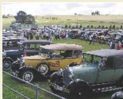
The 2012 Rally held at Ipswich, in southern Queensland, was a great success with over 160 cars taking part in the four-day event showcasing these magnificent machines.