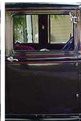
1930-31 Briggs Fordor