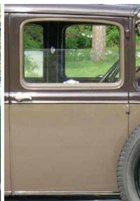
1928-29 Murray Fordor