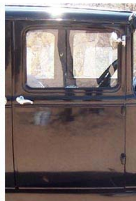
1930-31 Murray Fordor