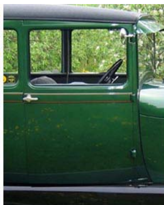
1928-29 Tudor (and Pickup)