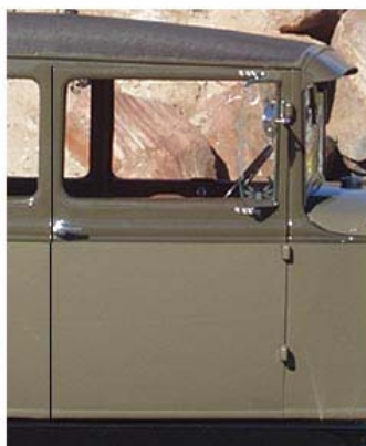
1930-31 Tudor (and Pickup)