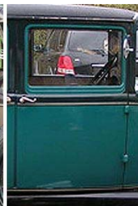
1928-29 Briggs Fordor