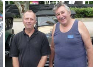
Some of the troops