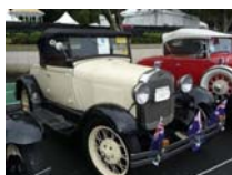
Big day out, now sleep time