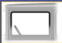
Briggs: straight top of door window opening

The difference between a Briggs & a Murray can be seen in the door windows. The tops of the windows are straight in a Briggs & arched in a Murray.