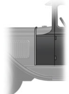
30 - 31 Cowl View