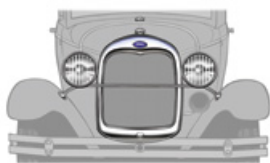
28 - 29 Front