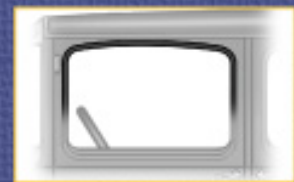
Murray: arched top of door window opening