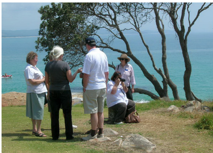
Scene at South West Rocks

ingly endless procession of whales close to shore, off Trial Bay jail headland.