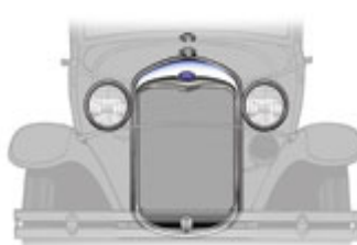
1930 Front View