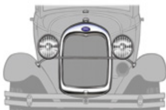
1928-29 Front View