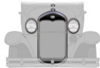
1931 Front View