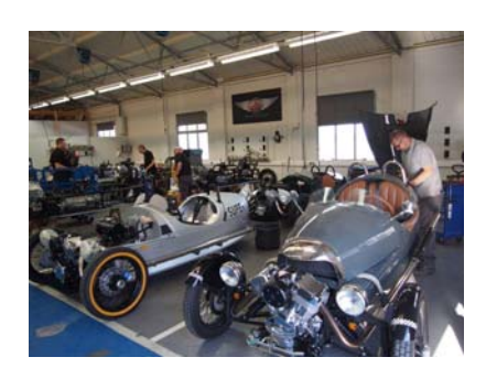
More pictures at <a href="http://www.modelafordclubofnsw.com.au/photo">http://www.modelafordclubofnsw.com.au/photo</a> album.htm