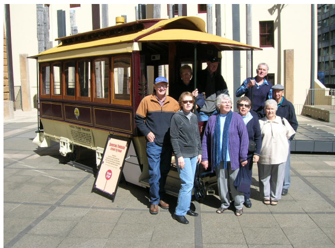
(above) Spot the old timer!