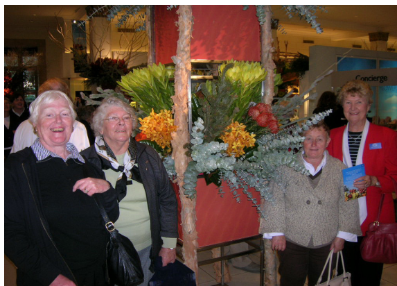
The ladies enjoying the Flower Show.