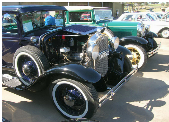
The Deane's 1930 5 window Coupe