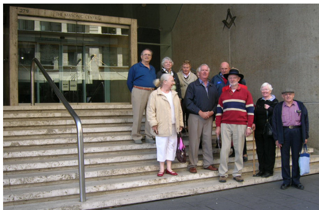
On the steps of the Masonic Centre