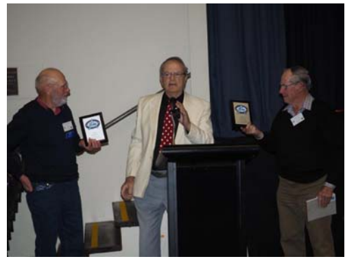
Model A Ford Club of NSW Inc