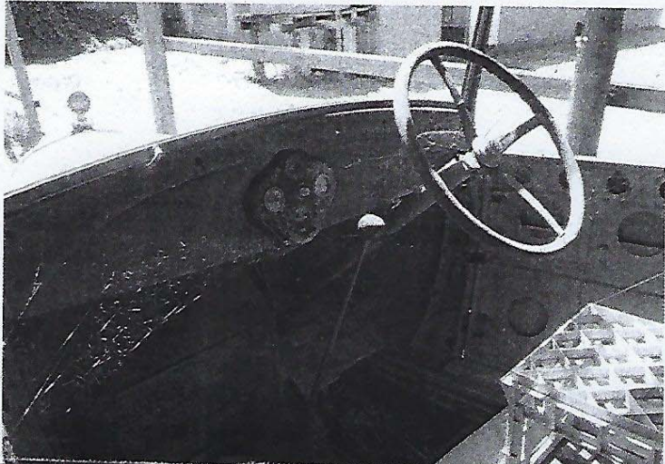
LEFT. The fr dash, etc. N the all-steel unlike the 19 Australian-b bodies, which were wood framed. The no outside handles on 1928 model: