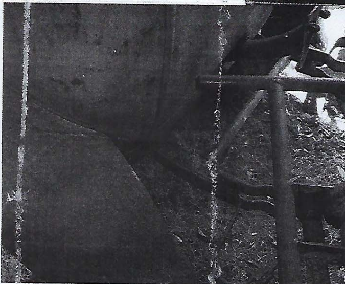
ABOVE. The rear tub section showed no corrosion. The car was in red primer and a restoration had been started at some point of time.