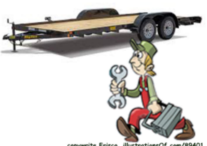
copywrite Frisco illustrationsOf.com/89401

A big manufacturer of trailer axles and brakes in the USA is Dexter, www.DexterAxle.com . They have a lot of good information about trailer brake maintenance and adjustment. I wanted to share with you a bit of what I learned and what I discovered on my trailer.