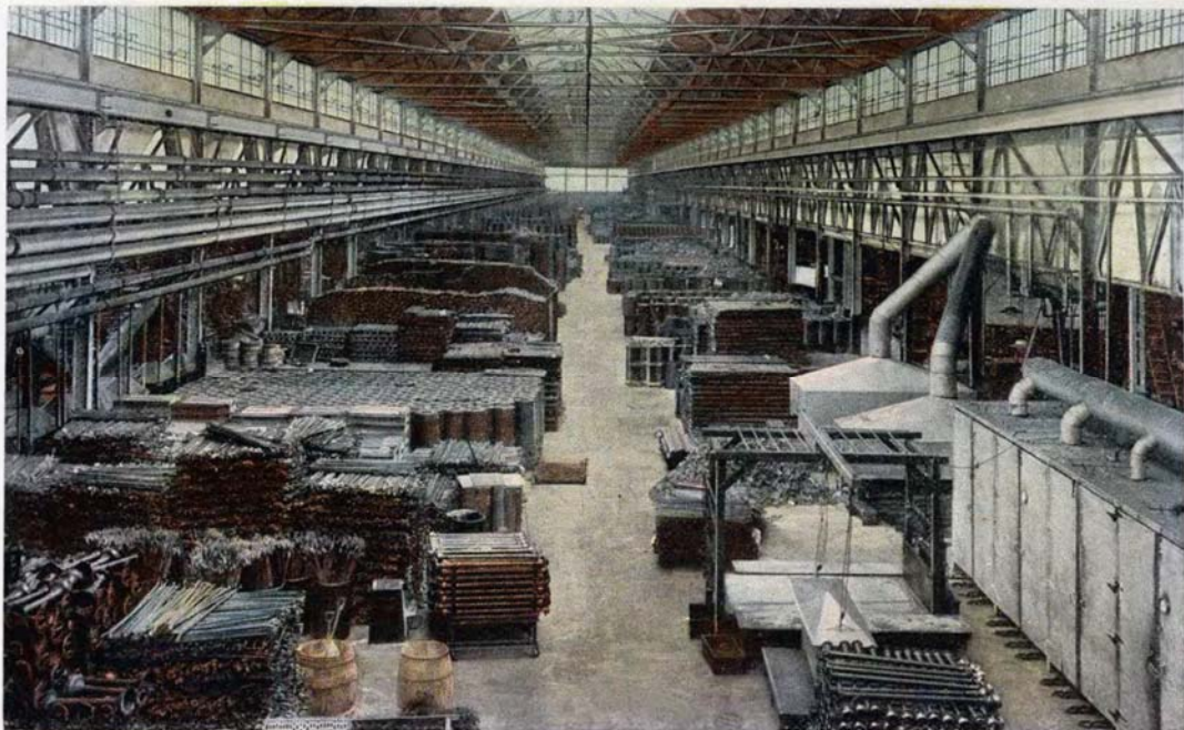
MAIN CRANeway. SHOWING STORAGE OF OVER $1,000,000 WORTH OF STOCK.