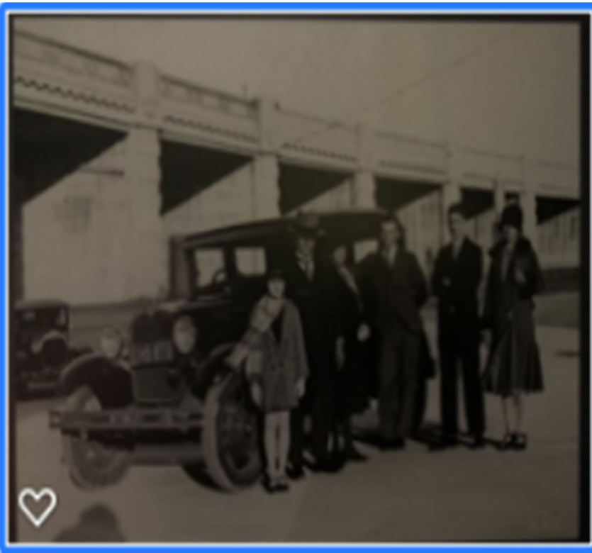
Model A Ford at the opening of the Harbour Bridge in 1932, ninety years ago.